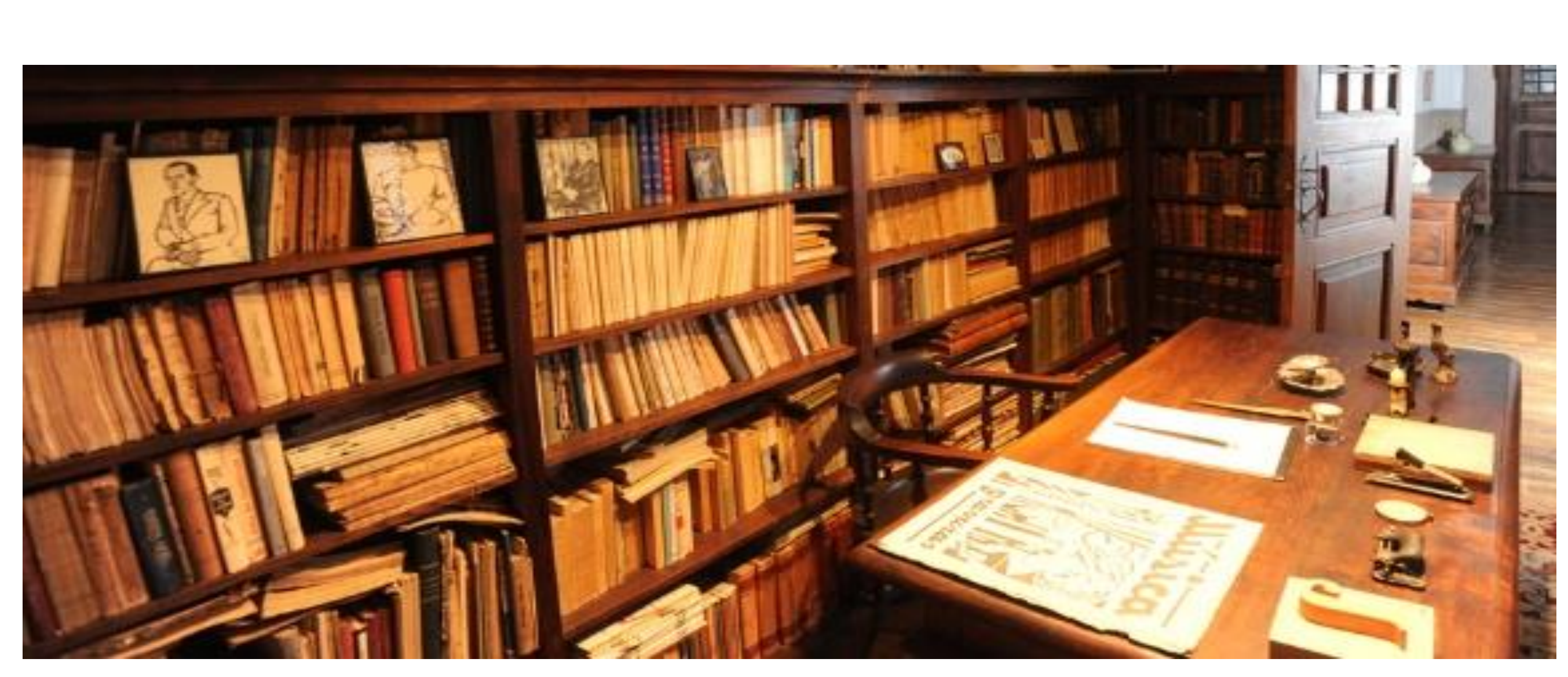
3. Francisco Bugalho's house

Within this Thematic Line the aim is to approach the topic of mobility by exploring three complementary avenues: literary mediations and cultural identities; cultural industries; languages, cultures and transnational exchange.